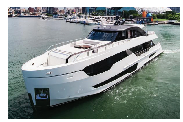
The all-new ALEXSEAL-finished 90R from Ocean Alexander is set to revolutionize the OA legacy.

This slot in the hull of the new Darwin 102 from Italian ship builder, Cantiere Delle Marche is painted in ALEXSEAL<sup>®</sup> Steel Grey Metallic which separates the Moss Green hull from the Snow White top sides