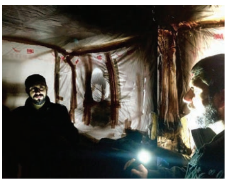
A perfect DOI on this ALEXSEAL Super Jet Black project by Thraki Yacht Painting