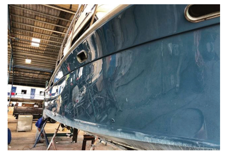
ALEXSEAL Stars & Stripes Blue sprayed on a 30' Riviera Yacht at Dalac Marine in Malaysia thanks to distributor, Oceanic Link Pte Ltd in Singapore