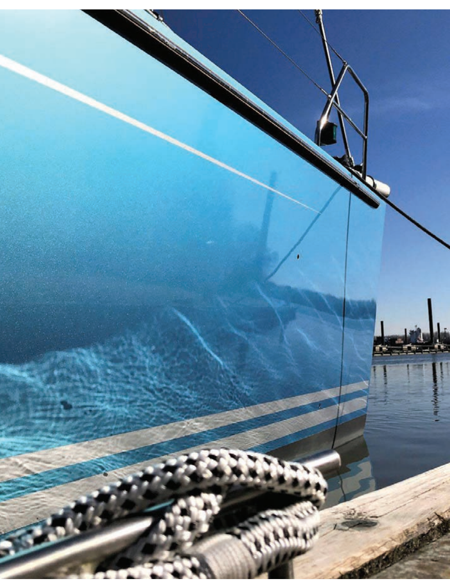
Look at this great reflection of ALEXSEAL metallic on S/Y Peppermint . This finish was achieved by long-time partner in Germany, Peter Wrede Yachtrefit GmbH & Co. KG