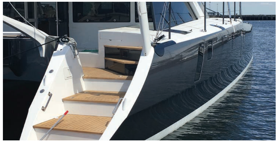
The Gunboat 60 Fault Tolerant is showing off an ALEXSEAL® double clearcoat sprayed by Hinckley Yachts