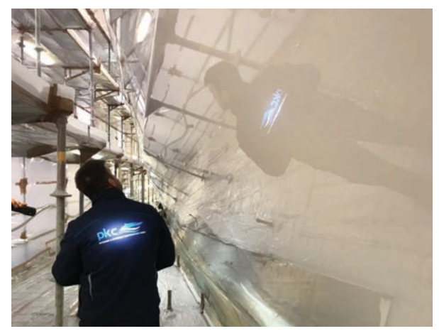
Working through the weekend paid off for PKC Yachtcoating Gmbh on this yacht refit project