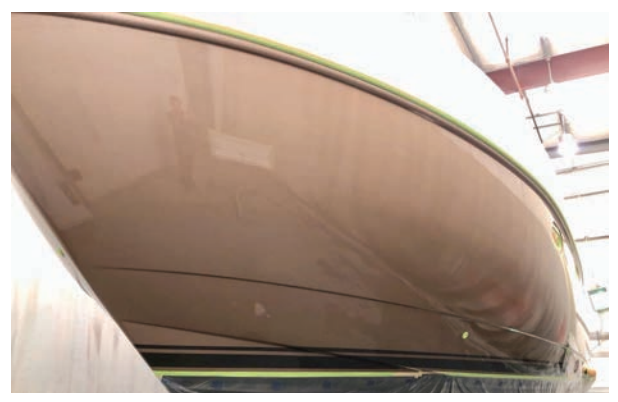
This 45' Tiara enjoyed a fresh top side finish in ALEXSEAL Hazelnut Metallic at the Seaview Boatyard in Seattle, Washington.