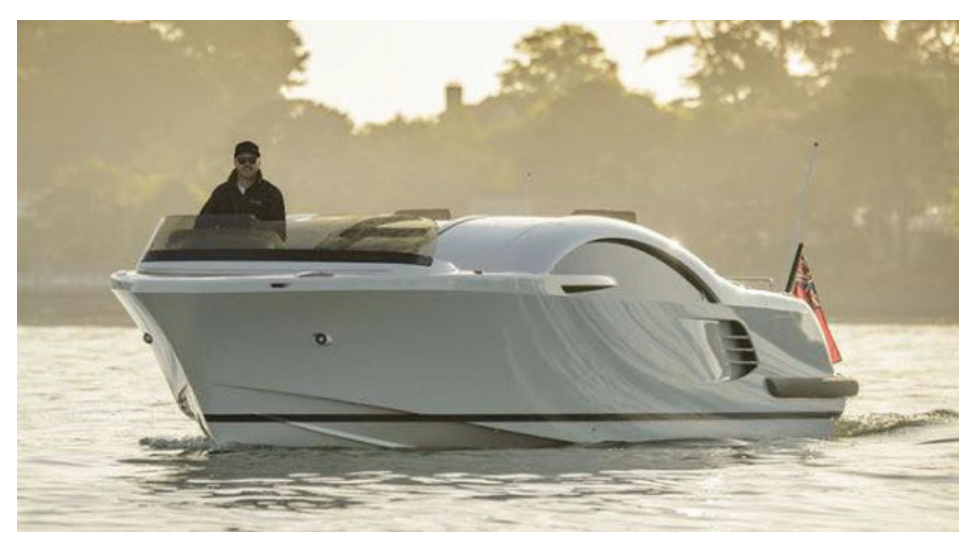
Compass Tenders, based in Southampton, UK, delivered two amazing custom tenders to the 110 meter (361') Superyacht ANNA, both finished in ALEXSEAL Oyster White