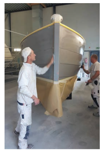
Primed and top coated in Anthracite Grey by Eitze Dijkstra Jachtschilder