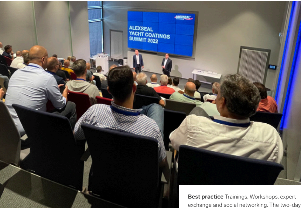
Best practice Trainings, Workshops, expert exchange and social networking. The two-day summit offered plenty of benefits for over 50 yacht coating experts.