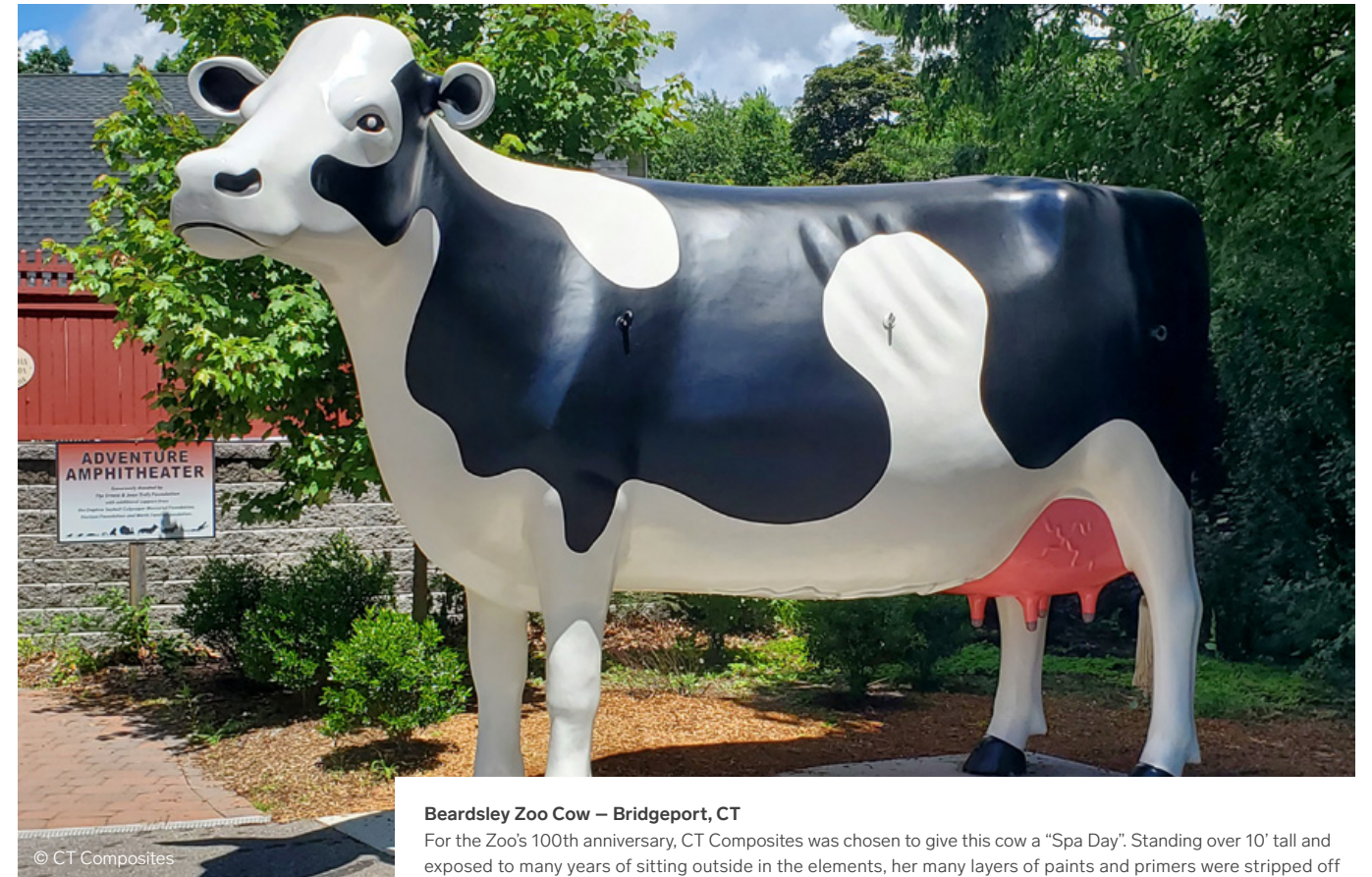
Beardsley Zoo Cow – Bridgeport, CT

Built with a lightweight composite body, CT Composites was able to easily offer durable, high gloss custom colors to their customer's clients allowing them to stand out from the rest of the crowd using ALEXSEAL® paints. ALEXSEAL® offers them a quick turnaround on custom orders allowing them to fill the customer's needs quickly.