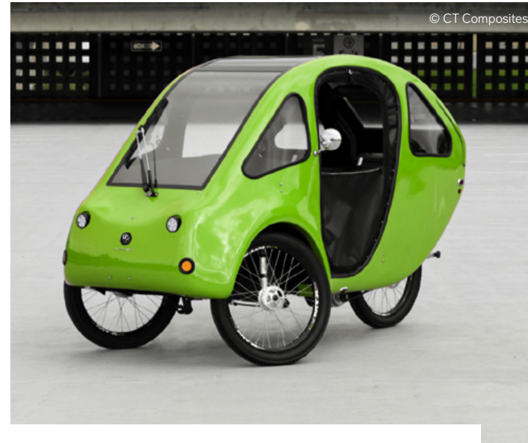
Better Bike PEBL Micro Car Ebike

“The ease of application is the first basic need of a good paint product,” so Tom. “The ALEXSEAL® products apply and cure well in a wide variety of temperatures and paint shop conditions, and they can easily produce a smooth high gloss finish time after time.” But it’s also a question of the right product portfolio: “It must be easy to manage”, continues Tom. “And the system is definitely simplified with a smaller number of products that cover a wider range of applications compared to other paint systems. This allows us to stock the core product and have it readily available for when needed.”